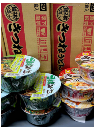
Steveston Japan Day