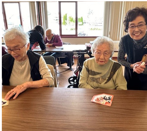
February Moe No Kai