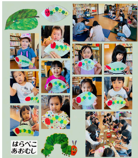
Takarajima Play Group May Craft